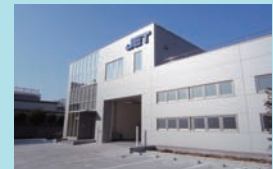
Research and Business Development Center