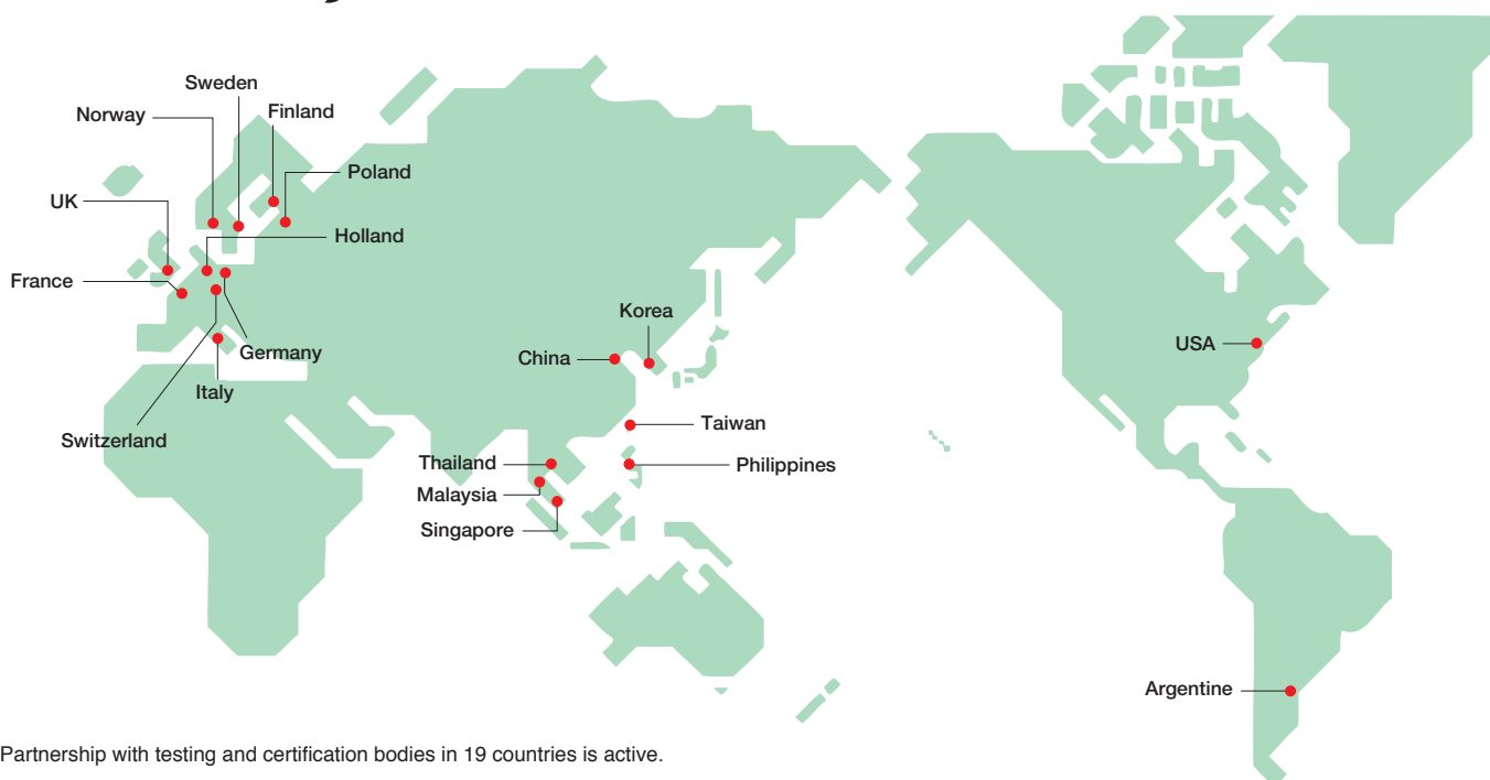
Partnership with testing and certification bodies in 19 countries is active.