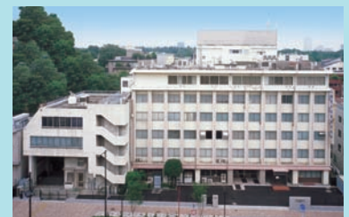
Head Office, Tokyo Laboratory